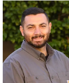
Anthony Rupert Facilities